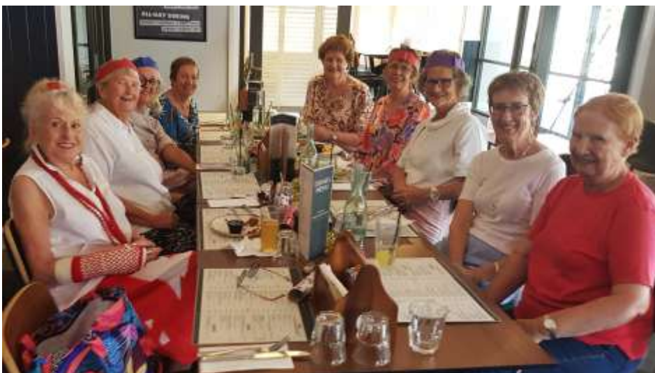
Out and About with the Book Club for Christmas lunch.

Please report any errors or omissions to the U3A Office.