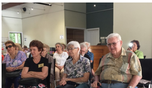
Members listening intently to the poetry