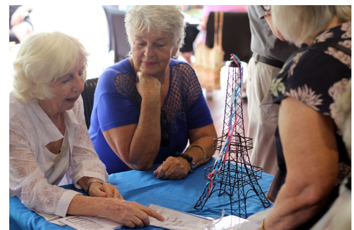
Ooh La La the French Connection